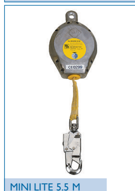
MINI LITE 5.5 M