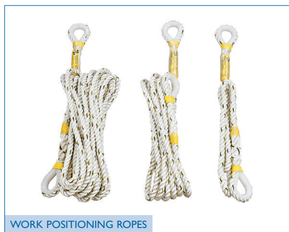
WORK POSITIONING ROPES